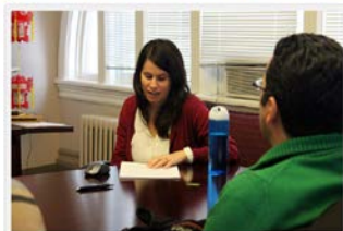
Center for Global Studies launches brown bag lectures January 23, 2013

Home Research Academics Impact Campus Life Athletics Administration Arts and Entertainment