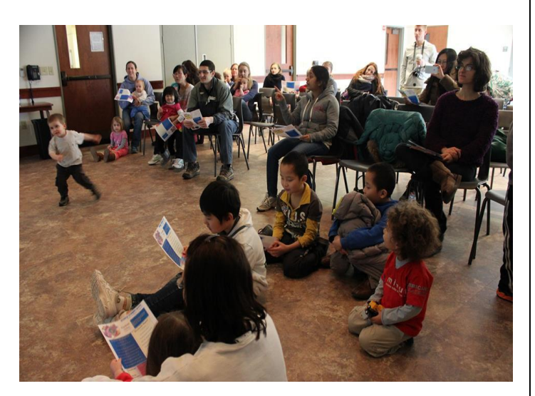
World Stories Alive is an event for the whole family!

Through these events, the Center for Global Studies and Schlow Library hope to play a part in helping local children form a global perspective. Exposure to different languages and cultures starting at a young age is fundamental to cultivating more open-minded and accepting children, as well as making them more globally aware. Oftentimes, traditional classroom settings may not have a chance to touch on some of the cultures and languages that are featured each Saturday morning at Schlow library. World Stories Alive exists to help bridge that gap.