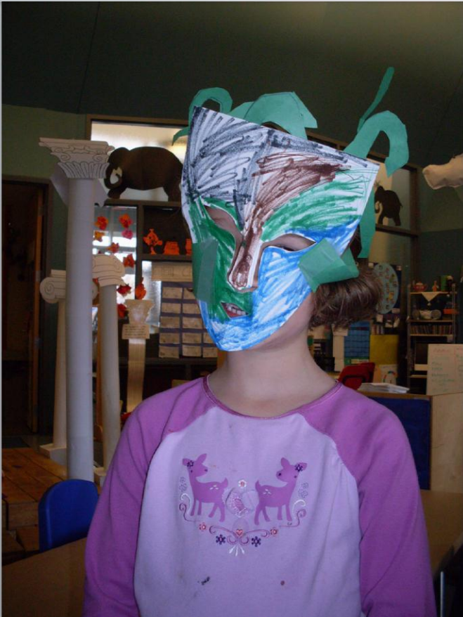
Medusa Theater Mask